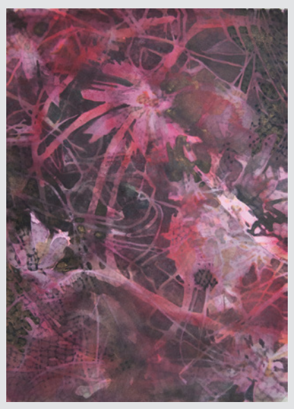
18x24", ink, gouache, watercolor, conte, graphite on paper

Read more about the exhibition: https://mabd.fi/nayttely/anne-yoncha-repeat https://anneyoncha.com