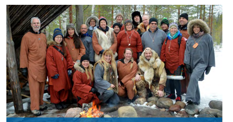
Cultural Exchange Between Finland and the U.S.