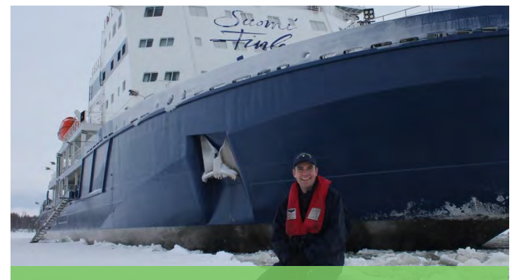
Cultural Ambassadors and Change Makers