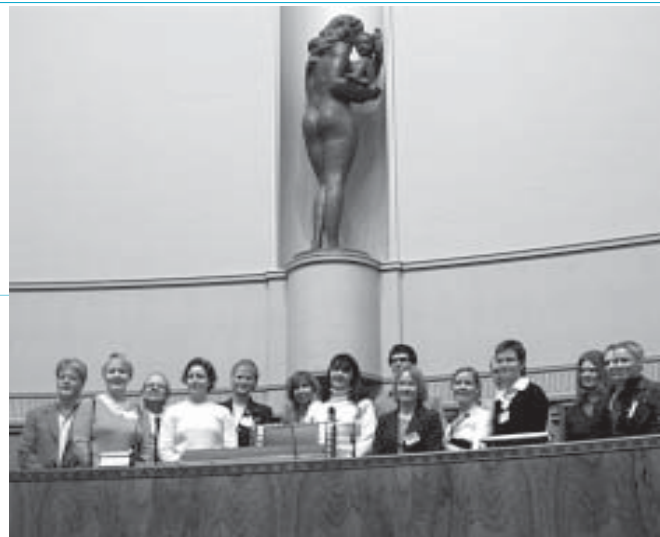
The two-day arrival orientation for the spring 2006 Fulbrighters was arranged at the end of January. The program included information sessions on Finnish society and culture, as well as various tours and events. Here the Fulbrighters are pictured behind the Speaker's Chair at the Finnish Parliament.